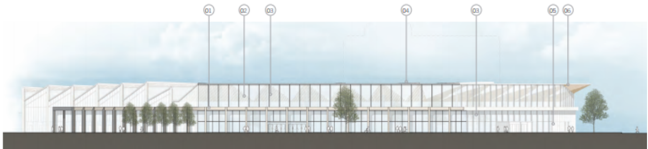
1:500 East Elevation